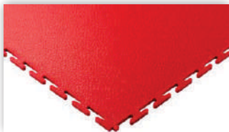
ecotile 7mm Smooth

ecotile Open Joint 500 x 500 x 7mm and ESD Tiles