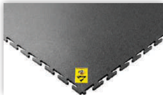
ecotile esd 7mm